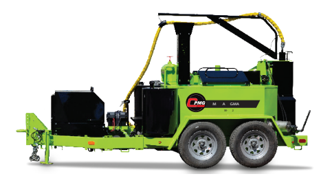
M-Series Crack Sealers